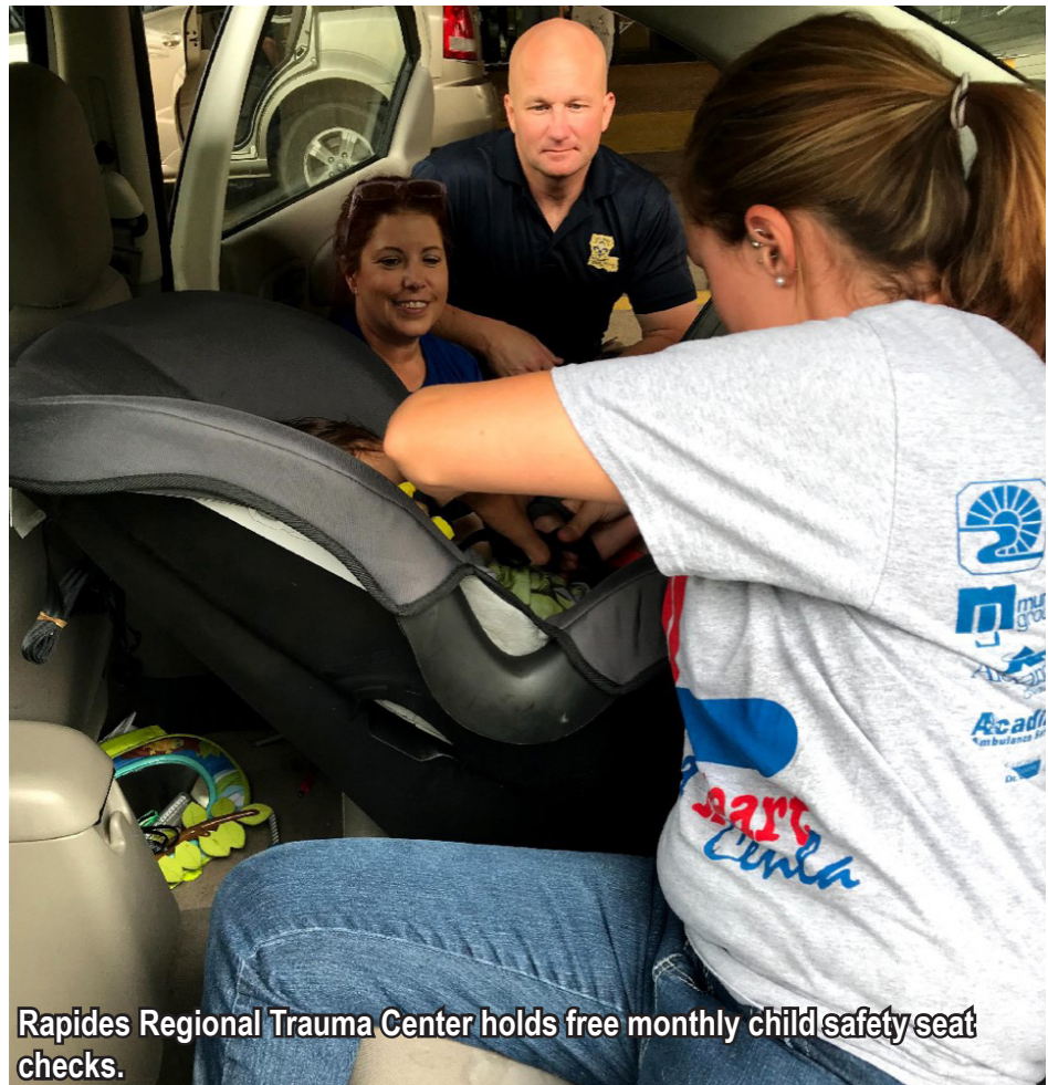
Rapides Regional Trauma Center holds free monthly child safety seat checks.

RRMC also hosts AARP's Safe Driving Course that is specifically designed for drivers age 50 and older, as well as being a sponsor of National Hunting and Fishing Day that teaches how to hunt safely.