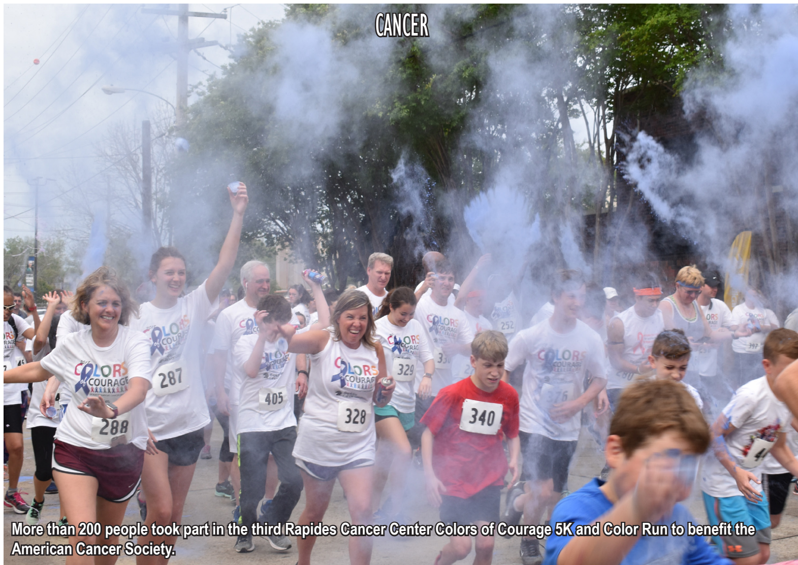
More than 200 people took part in the third Rapides Cancer Center Colors of Courage 5K and Color Run to benefit the American Cancer Society.

Rapides Regional Medical Center strives to raise awareness on the importance of cancer prevention and screenings. To help raise awareness, it holds a couple of major events each year.