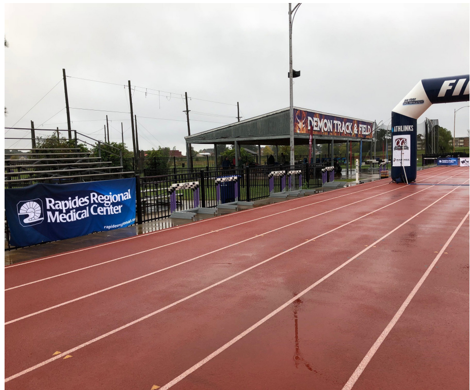
Rapides Regional Medical Center was a regional health care provider for the Louisiana High School Athletic Association during the 2018-19 school year.

WE also provided more than $8,000 in donations and sponsorships to various organizations in the community.