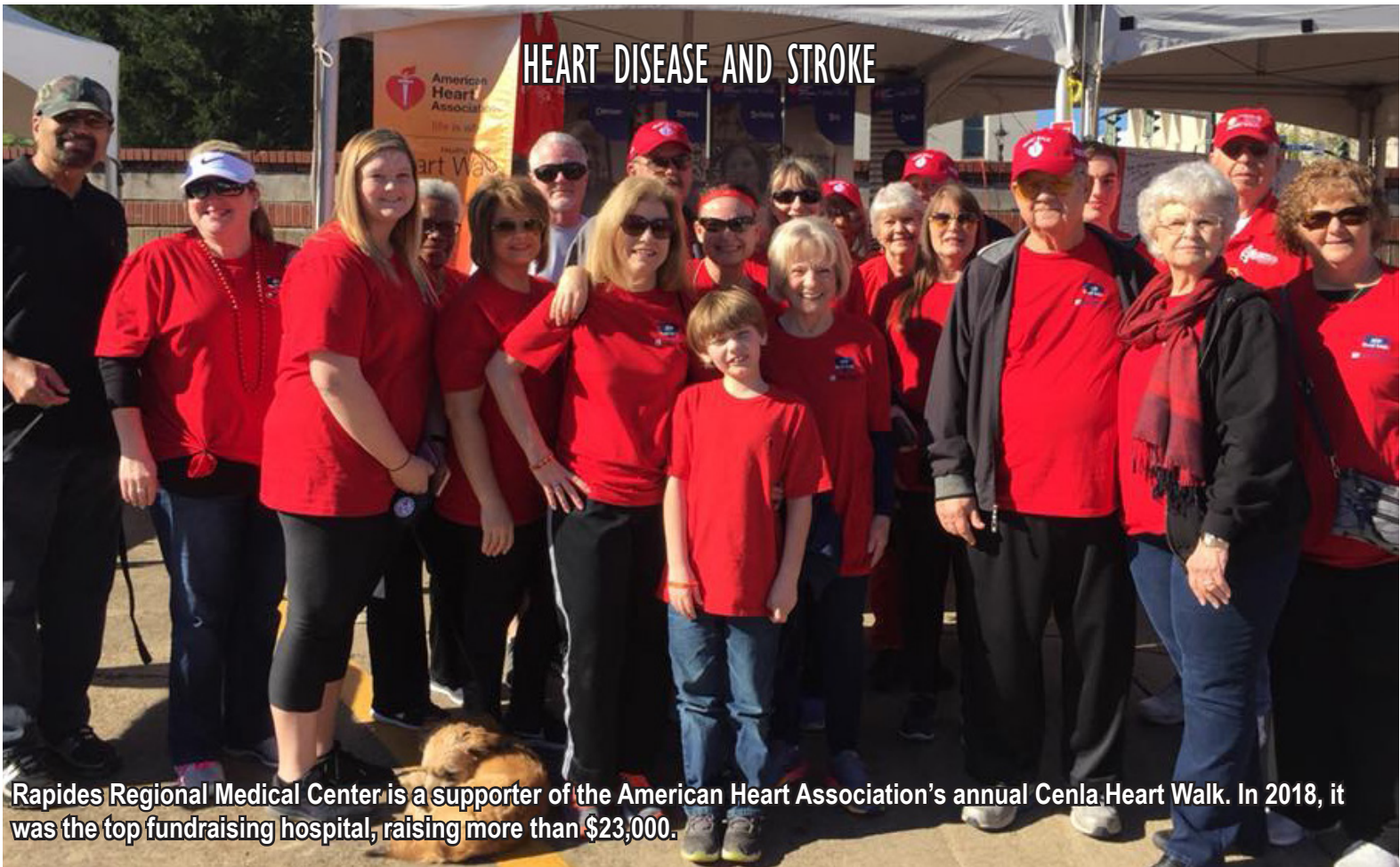
Rapides Regional Medical Center is a supporter of the American Heart Association's annual Cenla Heart Walk. In 2018, it was the top fundraising hospital, raising more than $23,000.

Rapides Regional Medical Center is a leader when it comes to educating the public on cardiovascular diseases, providing monetary support for cardiovascular health and prevention, as well as training laypersons and healthcare providers in basic life-support.