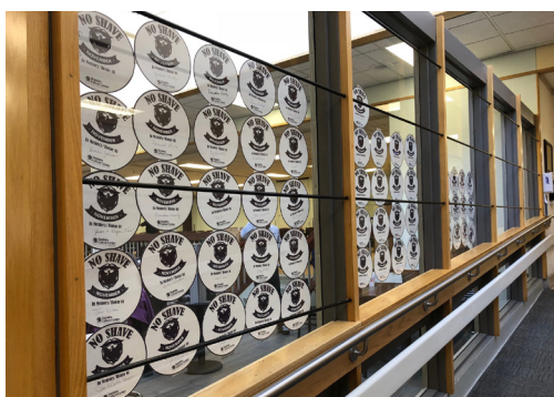
The fifth No Shave November raised $3,200 for patients of the Rapides Cancer Center.