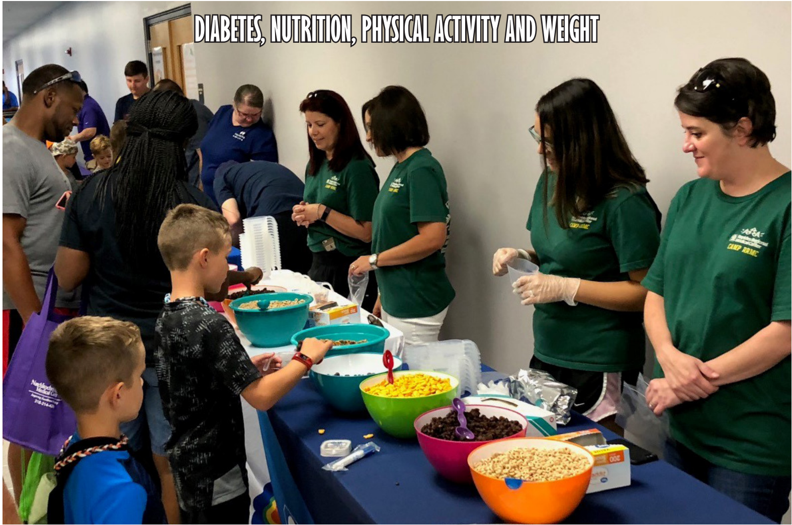
Participants at the 2018 Louisiana Sports Hall of Fame Junior Training Camp in Natchitoches learn how to make healthy snacks from Rapides Regional Medical Center staff.

Rapides Regional Medical Center promotes healthy living through an increased awareness of nutrition, physical activity and weight status as contributing factors in chronic health diseases such as diabetes, heart disease and cancer.