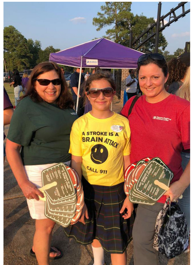
RRMC's Tackle Stroke awareness campaign handed out more than 2,600 hand-held signs at the local high school football jamborees in August 2018.

WE also work to educate our community on stroke awareness and treatment. Stroke is the third-leading cause of death in Louisiana and the leading cause of long-term disability. In 2018, RRMC participated in Stroke Education Day at the Louisiana Capitol. It also continued its Tackle Stroke program, with employees attending high school football jamborees at area schools. More than 2,600 area residents were exposed to the warning signs of stroke, and what to do if they spot someone exhibiting those symptoms.